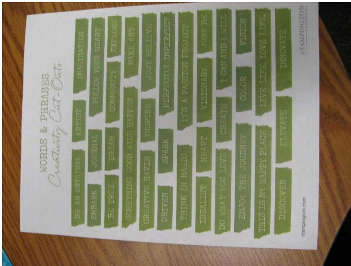
Word cutouts for artwork

Below is information about the gratitude journals the girl participants receive. This includes how to keep a gratitude journal, positive affirmations and thought questions on stickers shared throughout including definitions for role model/mentors. Also a few comments from girl participants: